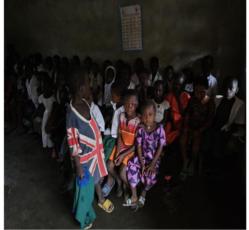
The classrooms are dark during the day without power light